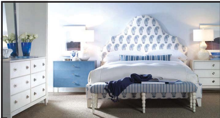
Window Treatments . Furniture . Flooring . Lighting . Accessories . Closets

on the state of the City of Sanibel. Souza educated Kiwanians on the strategic planning process the city council has directed, a first for the city in over 20 years. He discussed the competitive employee market, addressing the council-directed wage and compensation study, another first in many years. Numerous current issues were touched on based on local and regional factors.*